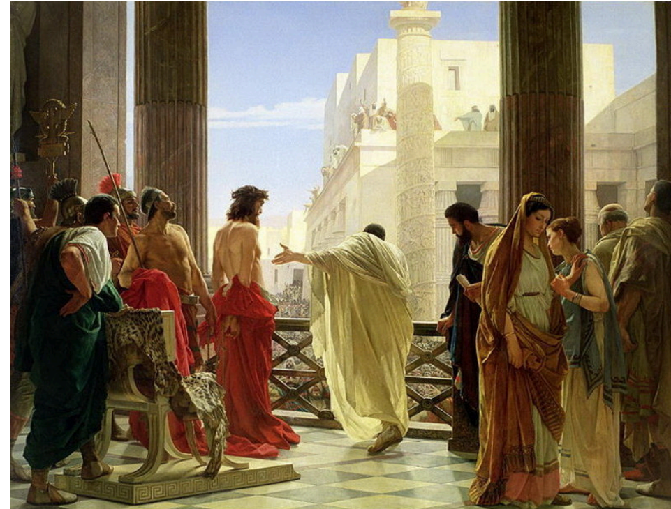
"Ecce Homo" ("Behold the Man") by Antonio Ciseri